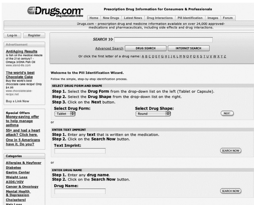
FIG. 1. The www.drugs.com interface, a text-based system for pill identification. The interface guides users through a step-wise process (based on the color or type of pill). Results appear on separate Web pages for each step, with a pill image only at the last step.

Participants were asked to locate information about three different pills in each of the two databases, using color images of pills (both front and back) printed on 3 × 5 recipe-style cards; 11 pills were examined, randomly assigned across the interviewees. Digital audio recordings were used to gather the interview data and to record individuals' perceptions during the task-based sessions, and were fully transcribed. Digital video was used to capture screen images during the task-based activities. A verbal analysis protocol was used to allow participants to comment on their preferences for navigation, layout, aesthetics, etc., in each interface. Task completion checklists were also used to track which search features (e.g., zoom button) the interviewees used on their own, and which ones they used only when prompted to do so by the researchers. It should be noted that participants were first asked to search for each pill using any search process or feature that they felt were appropriate; once they had done so, the researchers pointed to any additional (unused) features, so that each participant commented on all available search features. This was an important step in the design of the project as some participants simply did not see (or did not understand) particular design features; these findings are discussed in detail later in this article.